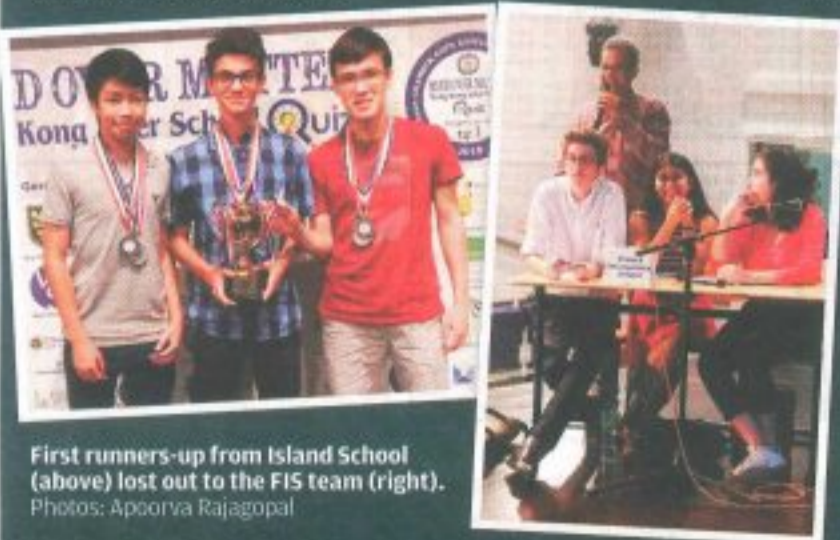
First runners-up from Island School (above) lost out to the FIS team (right).